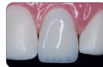
[ Final polychromatic restoration ]

Optional Edge Effects: Refer to the Artiste® Technique Manual for detailed instructions on creating an esthetic incisal halo effect and on creating internal color characterization with Artiste® Maverick™ Tints to match natural dentition.