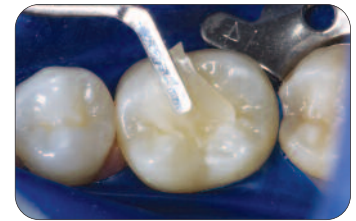
[ Enamel layer applied in 2 vertical increments ]