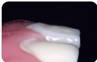
[ Dentin/Body Anatomical layer ]

Note: Apply Artiste® Nano Composite in 0.5mm to 2mm layers maximum.