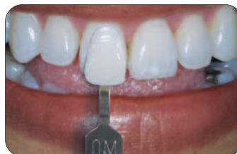
[ Base Shade Selection ]