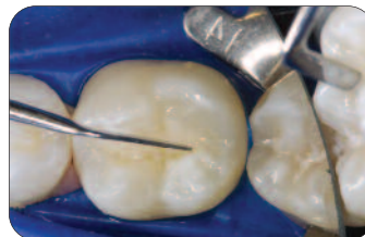
[ Lingual wall increment ]

Note: To avoid polymerization stress on the bond, do not connect opposing walls. Apply the Dentin/Body layers just shy of the cavosurface margin leaving approximately 0.5mm to 0.75mm for the enamel layer. Follow the cusp and fossa form of the remaining tooth anatomy.