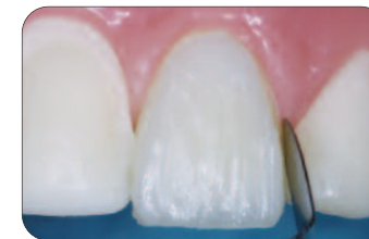
[ Enamel layer to full contour ]