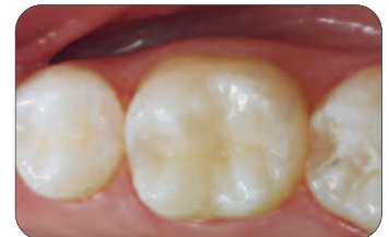
[ Final polished restoration ]

Note: This vertical posterior layering technique is provided to minimize polymerization stress during cure. A traditional horizontal layering technique may be used if desired.