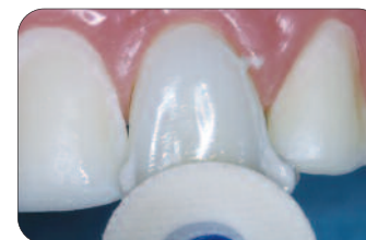
[ Polish ]