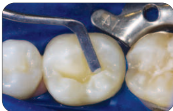
[ Buccal wall increment ]