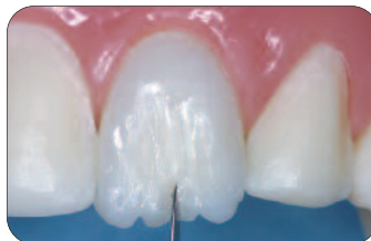
[ Dentin Mamelons ]